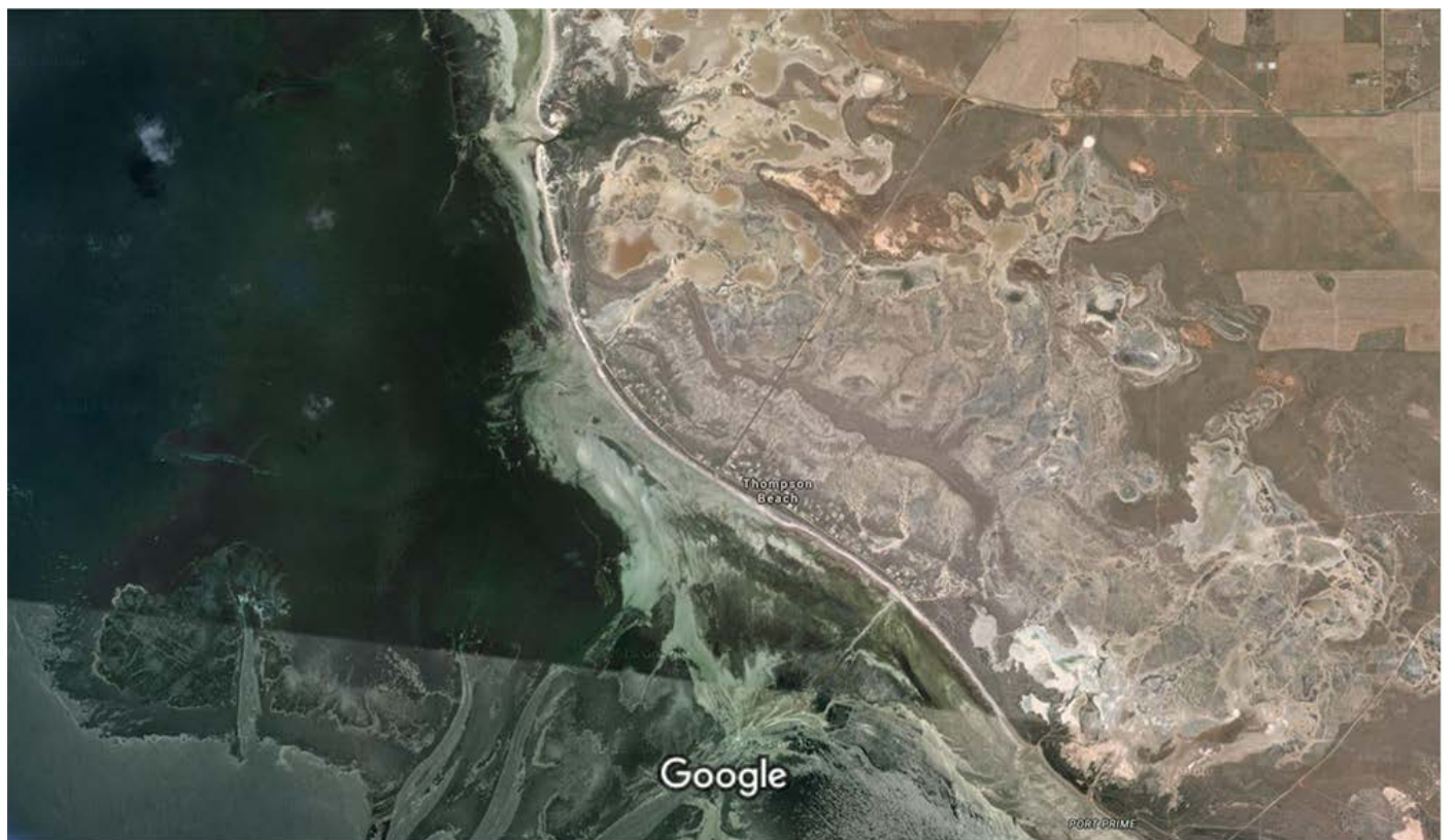
500 m